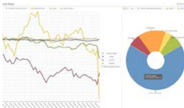
Reporting functionality powered by the Cross-Asset Trading and Risk Platform

Investors are demanding increased transparency and communication on all aspects of their allocation to a fund. The ability of Cross-Asset Trading and Risk Platform to generate the necessary data, including regulatory data such as solvency capital requirements, either natively from the platform or as part of a managed service, is a key part of this offering.