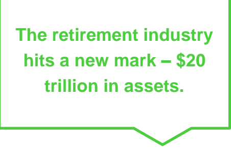
2015 SPARK MARKETPLACE UPDATE