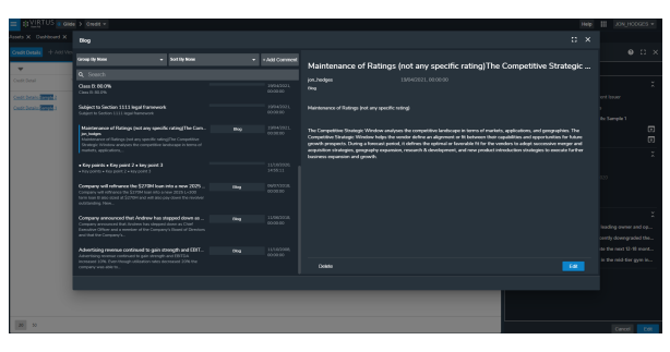
Capture and view firm notes

Manage increased regulatory activity resulting from less sophisticated investors entering the market.