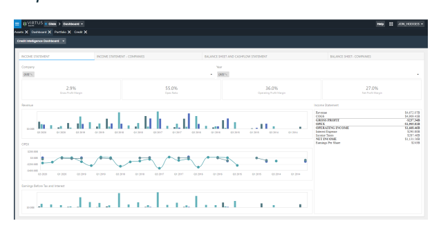
Snapshot of holdings/financials